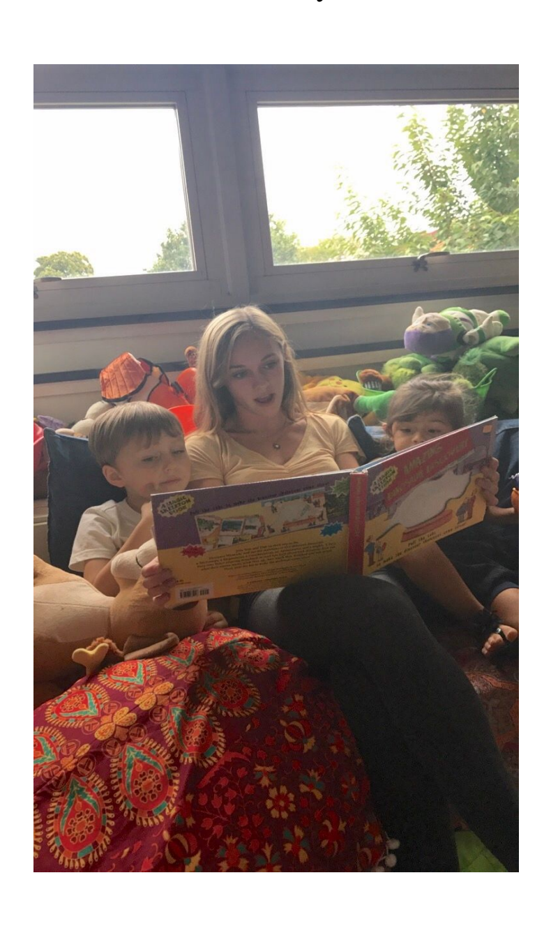
Standard: 1.1 PK.B Identify basic features of print

EMERGENT LITERACY Literacy development helped me acquire the skills of communication, writing, and preparation for reading.